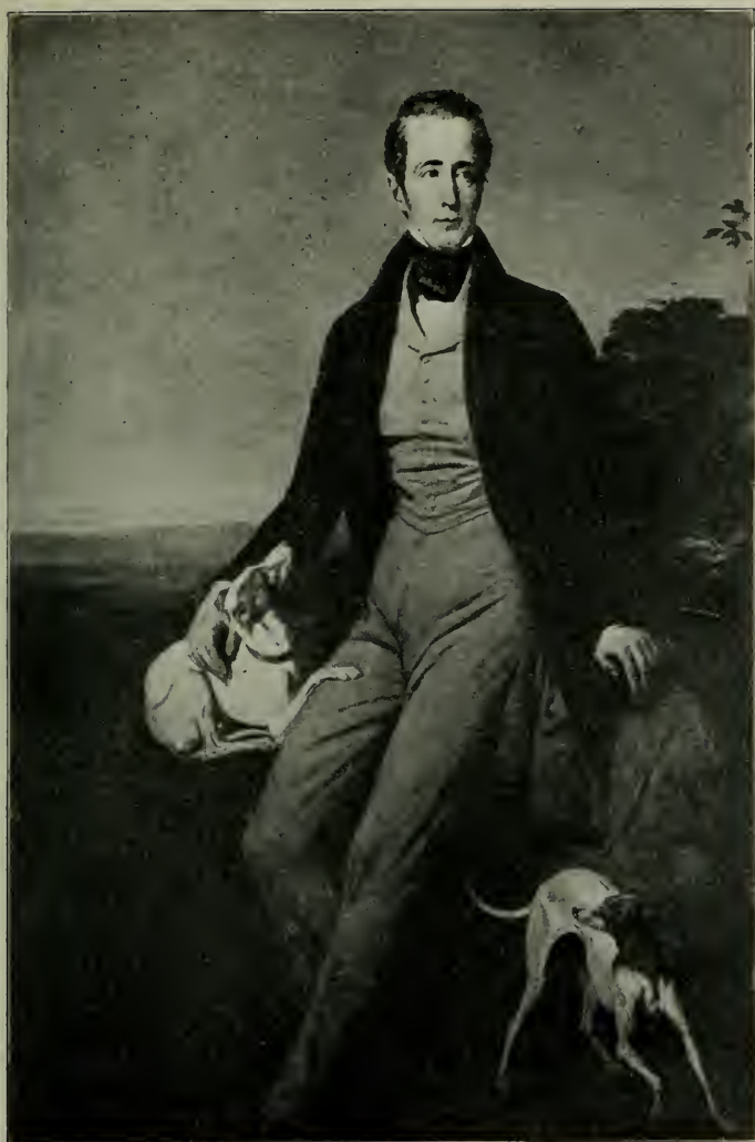
LAMARTINE IN 1839 From the painting by Decaisne